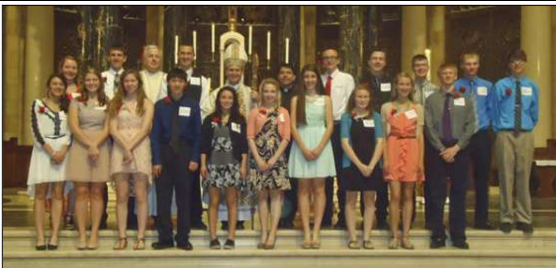
St. Pius V - Cannon Falls