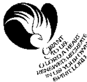
St. Joseph - Miesville